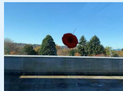
Artistic photo of a poppy pin