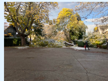
Fallen tree during first snowfall